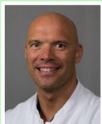
Nicolas van Mieghem Fellowship Grants