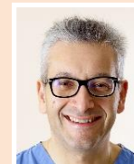
Mamas Mamas Innovation & Digital Cardiology