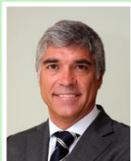
Rui Teles Training and Certification