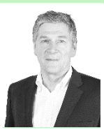
Thierry Lefevre Fellowship Grants